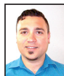
Jake Kazakoff Financial Services